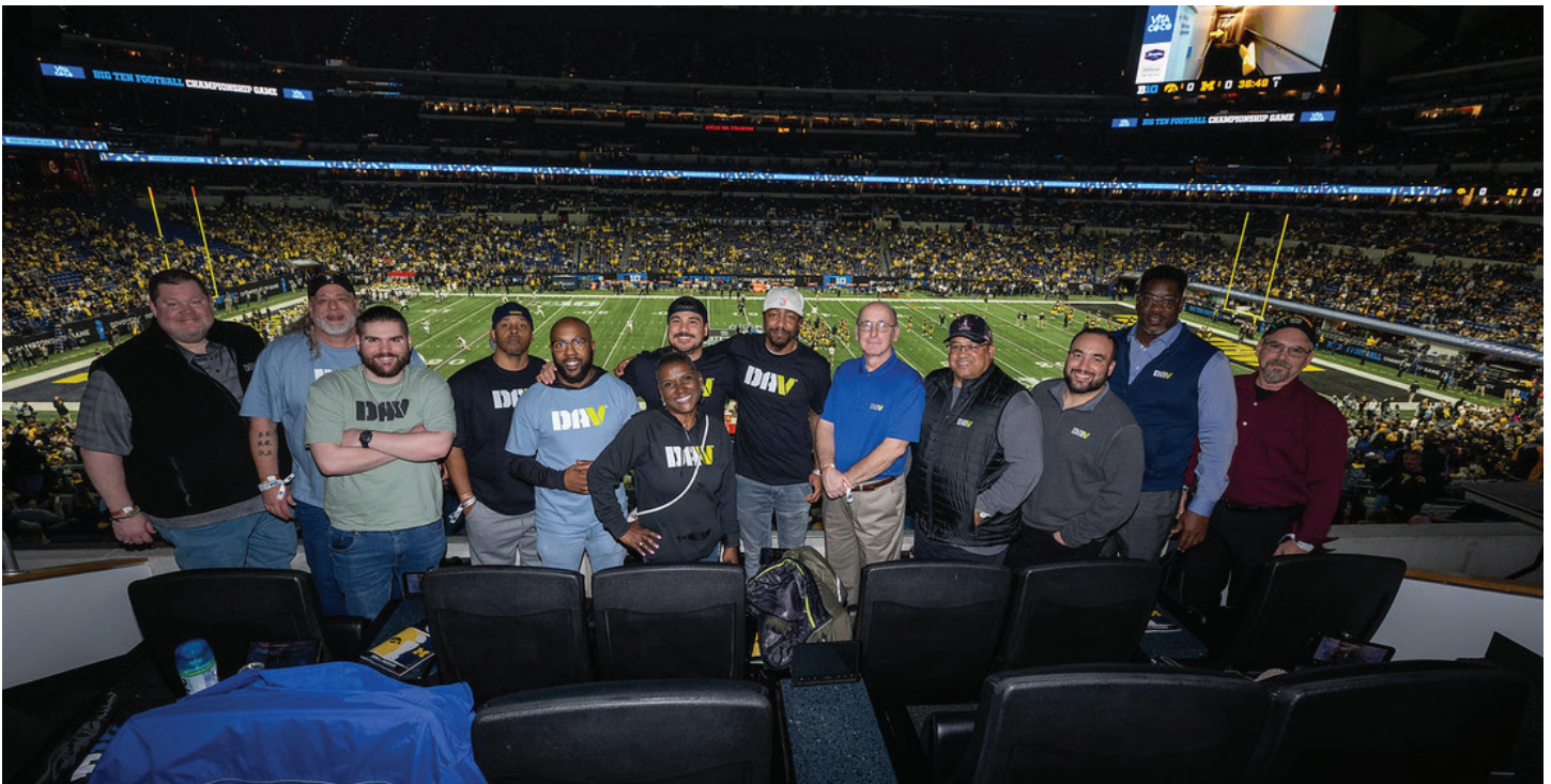
THEATRE-STYLE AND LOUNGE SEATING