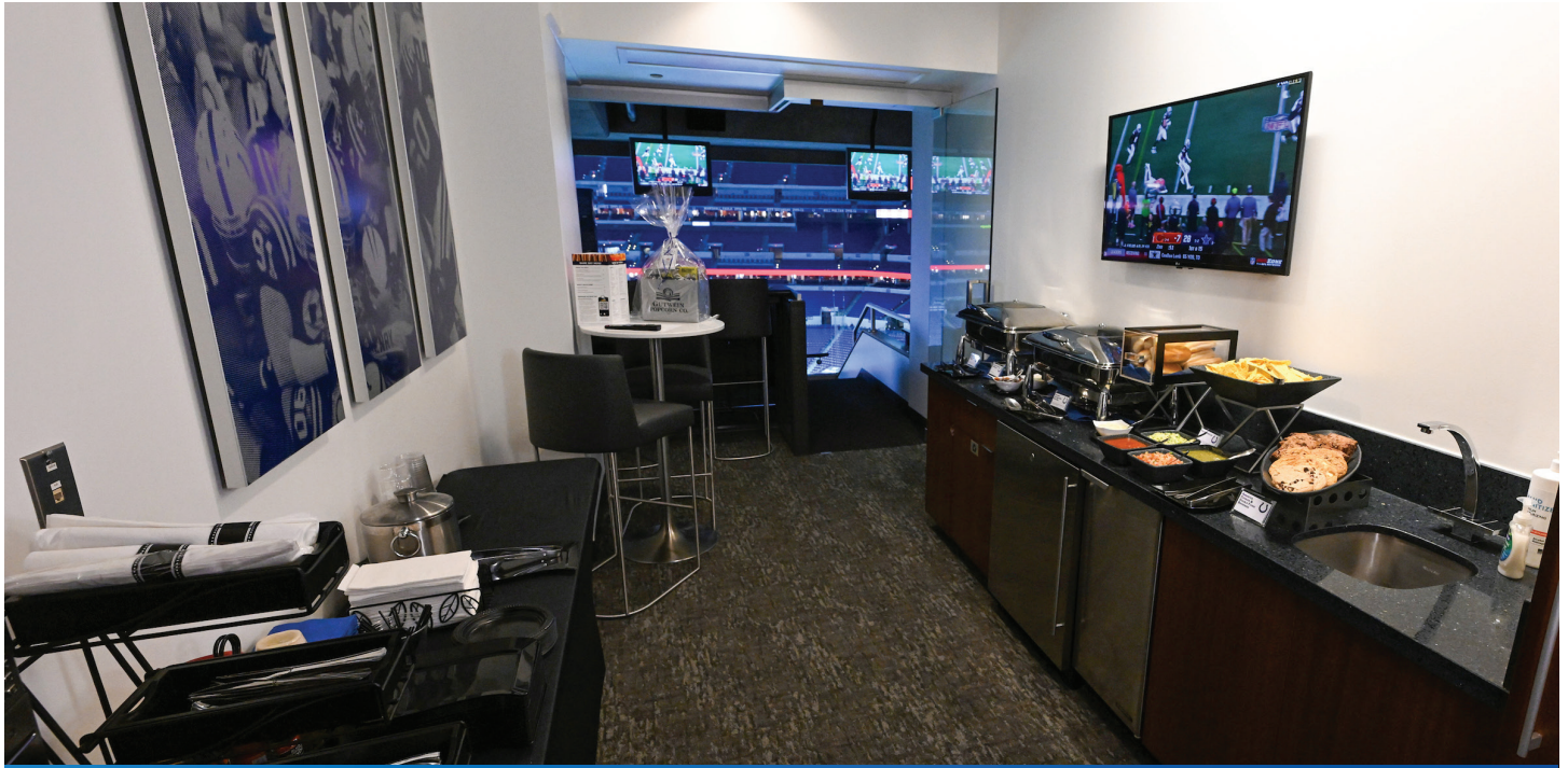
8 PERSON SUITE